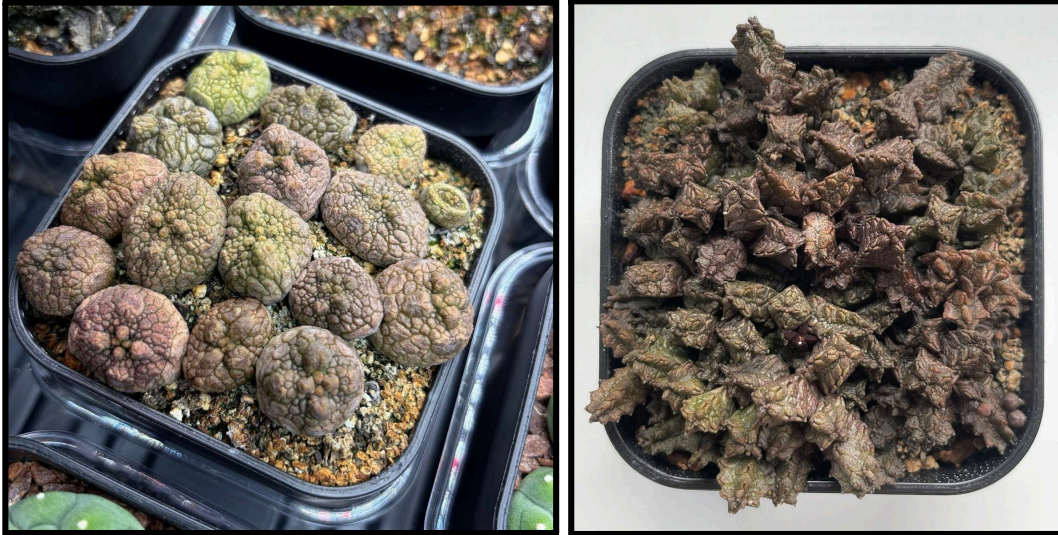
7 month old Pseudolithos Cubiformis (Left) and 7 month old Pseudolithos Mccoyi Flowering (Right)

Pseudolithos are easily one of my favorite genres of plants. Since I began my plant journey 2 years ago, I have become deeply obsessed with these succulent plants with lizard-like skin and stunning fleshy flowers that smell like rotten meat.