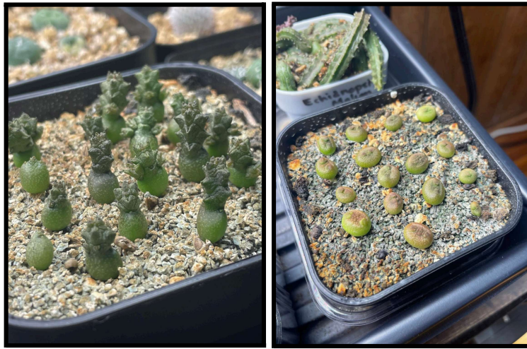
Pseudolithos mccoiji true "leaves" emerging

The true 'leaves' of the seedlings will emerge fairly quickly. Sometimes, seedling development will stall, but they will resume growth when they feel like it.