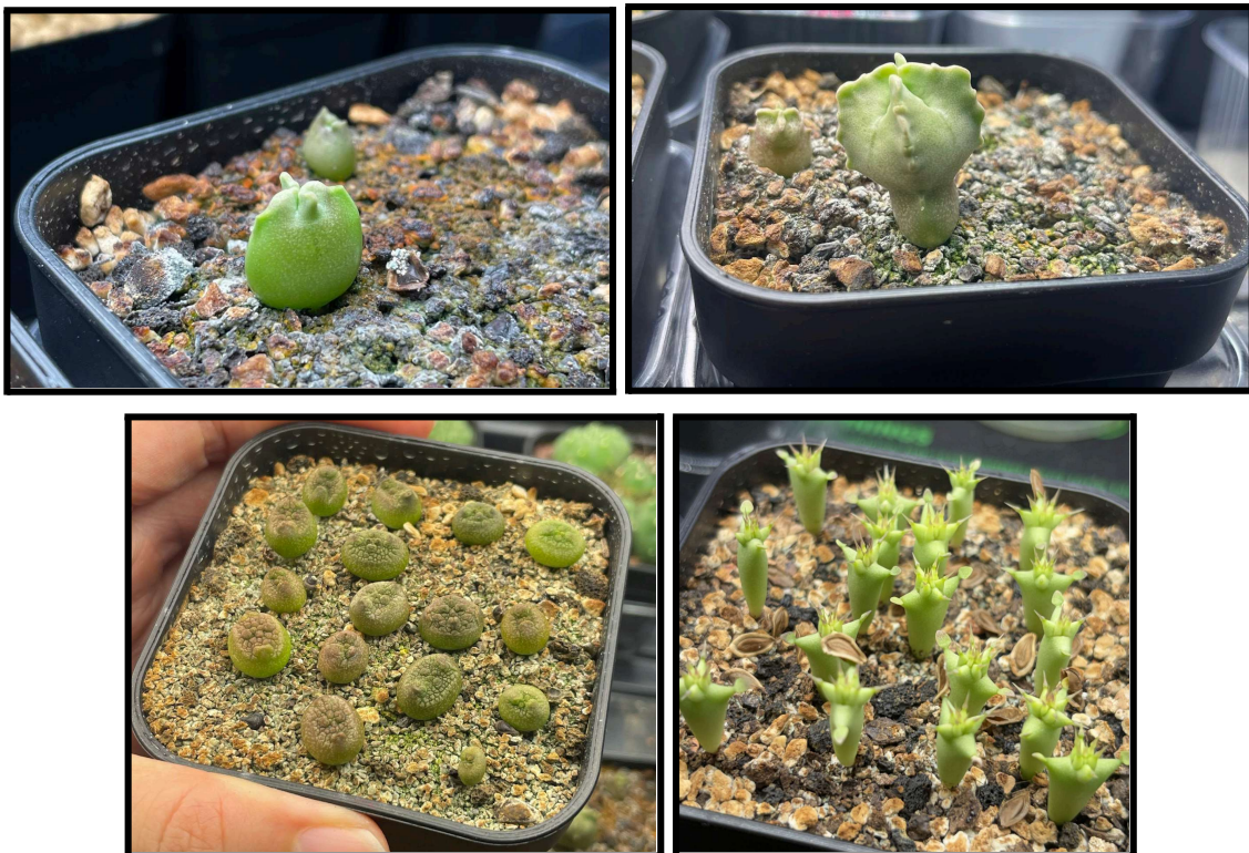
Whitesloanea Crassa , Pseudolithos Cubiformis , Hoodia Juttae

This concludes my guide on growing Pseudolithos from seed - hopefully it makes these lumpy plants feel less intimidating! Below are a selection of photos of some of my seedlings during their growing process.